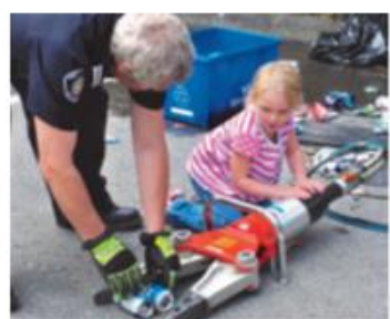
Hands on Demos