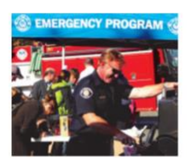
Food & Drinks